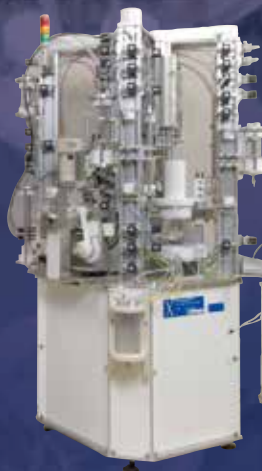
Parallel high-speed pretreatment unit for fertilizers