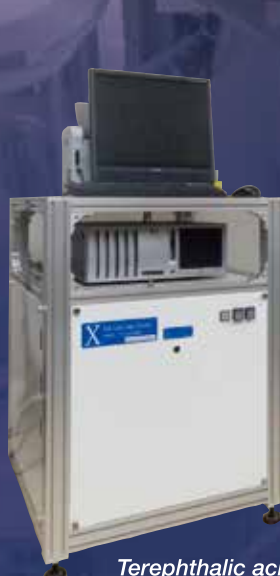
Terephthalic acid unit within an in-line system operating around the clock