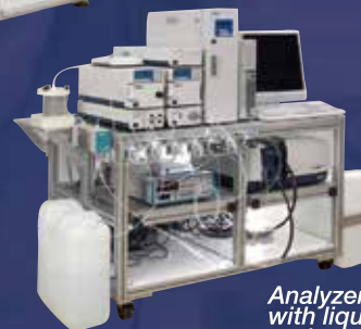
Analyzer unit with liquid calibration system module attached